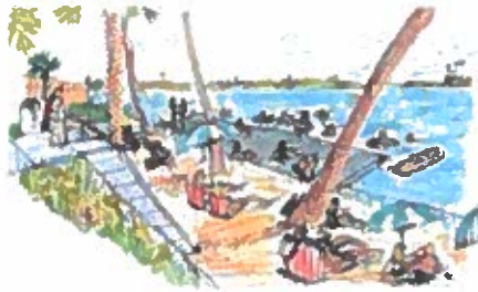
Caribe Isle Park