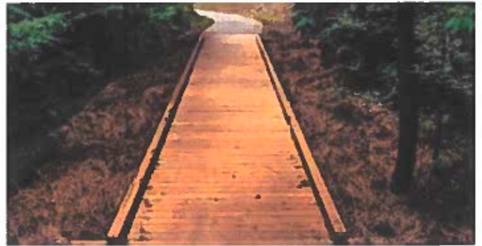
ADA ACCESSIBLE COMPOSITE BOARDWALK