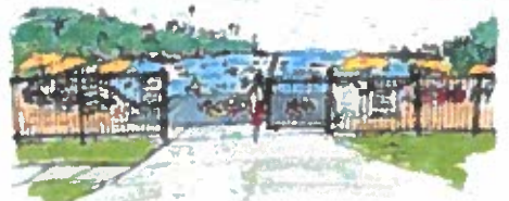
Bahama Reef Park