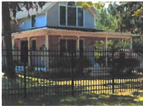
FREEDOM PROVIDENCE FENCING